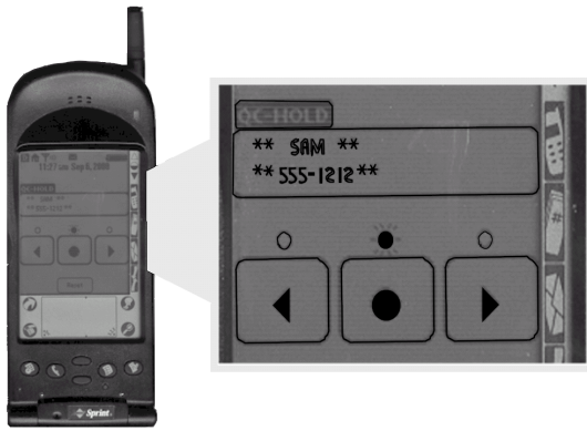
Figure 2. A three-button design allows users to respond with button presses rather than by speaking aloud.

course of the conversation or even the next utterance [13]. For example, saying “I’d better go now” or “Goodbye” does not necessarily mean that conversation will immediately stop (e.g., the response might be “Just one more thing...”). Lastly, some variability of expression was desired to make the system seem less mechanical.